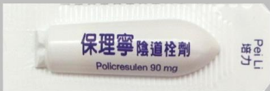
Polinin 90mg Vaginal Tablet 保理寧陰道栓劑